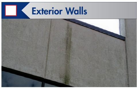
Check for leaks, staining, and missing mortar.

Exterior: Evaluate exterior of building for obvious evidence of existing or potential leaks.