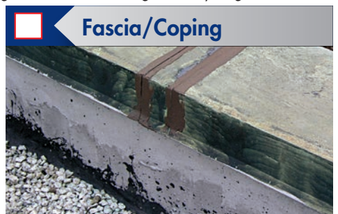
Check for leaks, staining, and missing mortar.