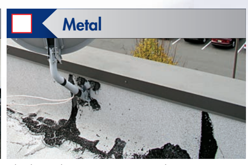
Check attachment; paint any rusted metal; recaulk as necessary.

Interior: Examine interior roof deck, walls, and ceiling for evidence of leaks.