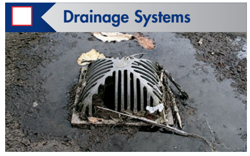
Clear all gutters, down spouts, and scuppers; clean out drains; check strainers and clamping rings.