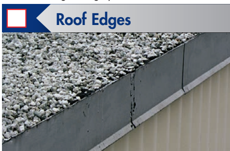
Check for deterioration.