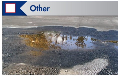
Check for oil deposits, surface contamination, soft areas, vandalism, and ponding water.