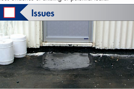
Does roof need cleaning? Are there traffic patterns or are walkway pads needed?