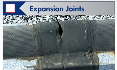
Check for signs of excessive movement, leaks, or deterioration.