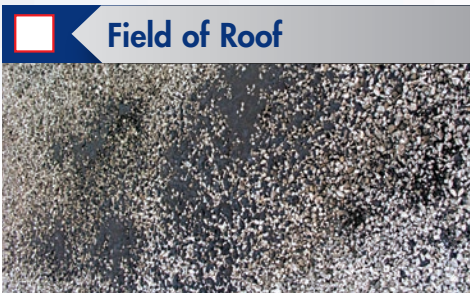
Redistribute ballast; note damage/deficiencies; inspect coating.