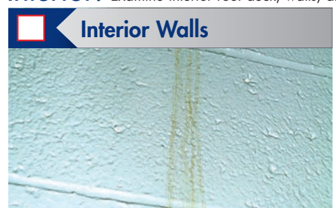
Check for signs of leaks.

Interior: Examine interior roof deck, walls, and ceiling for evidence of leaks.