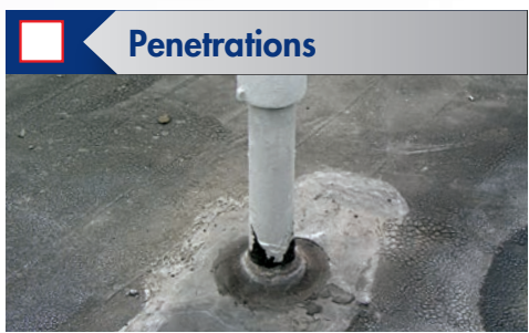
Fill all pitch pans; inspect pipe boots.