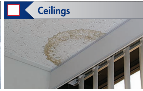
Check for signs of leaks.

Roof Perimeter: Evaluate base flashing, metal work, caulking, and anything that would affect the watertight integrity of the roof.