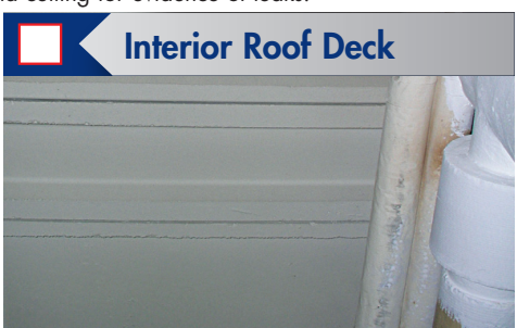
Check for signs of leaks or deterioration.