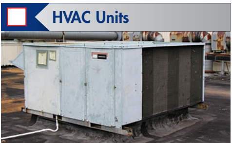
Check ductwork, housings, lines, pipes, sheet metal cabinets, gaskets, and equipment base/tie-in.