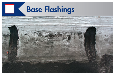
Check attachment; check counterflashings; inspect for signs of movement.

Roof Perimeter: Evaluate base flashing, metal work, caulking, and anything that would affect the watertight integrity of the roof.